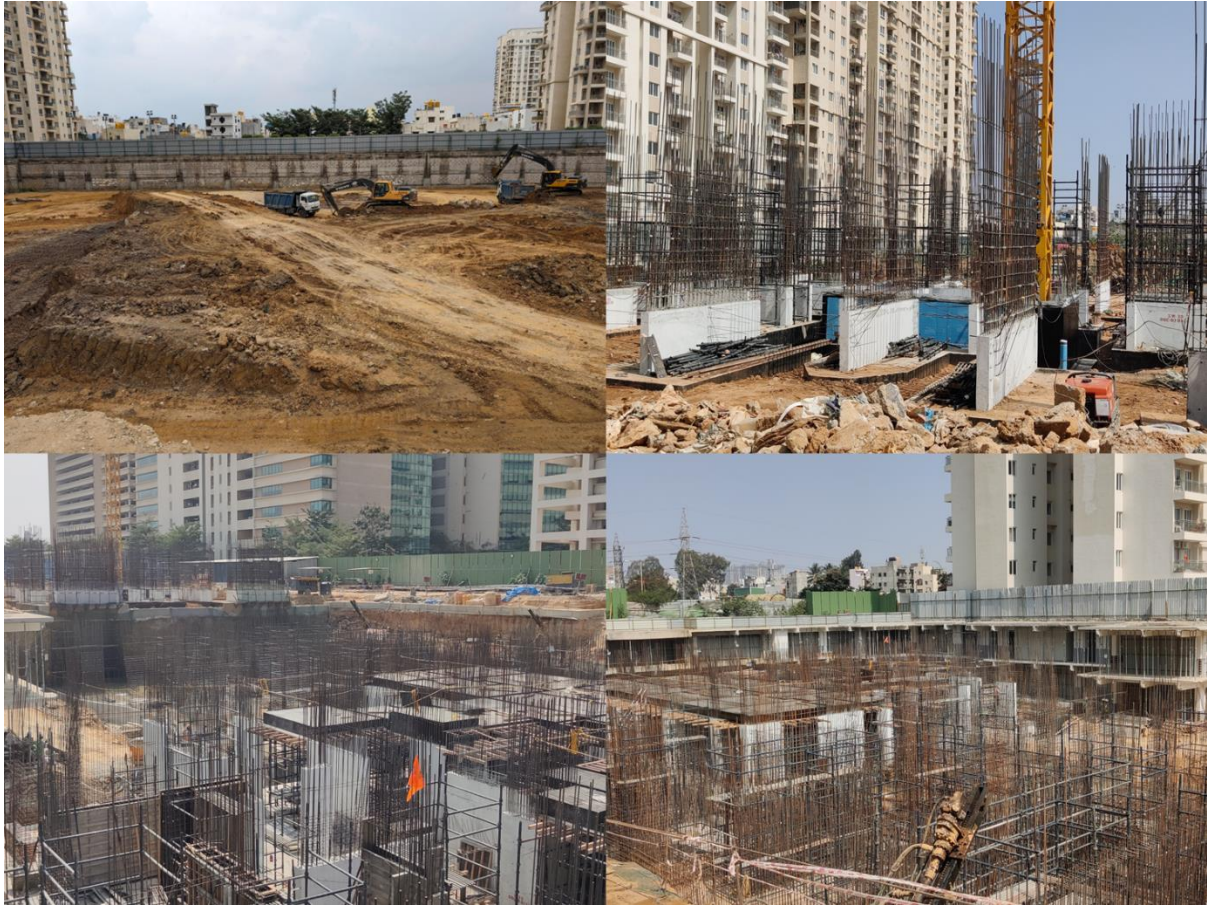
Photographs: Phase 2 Under Construction