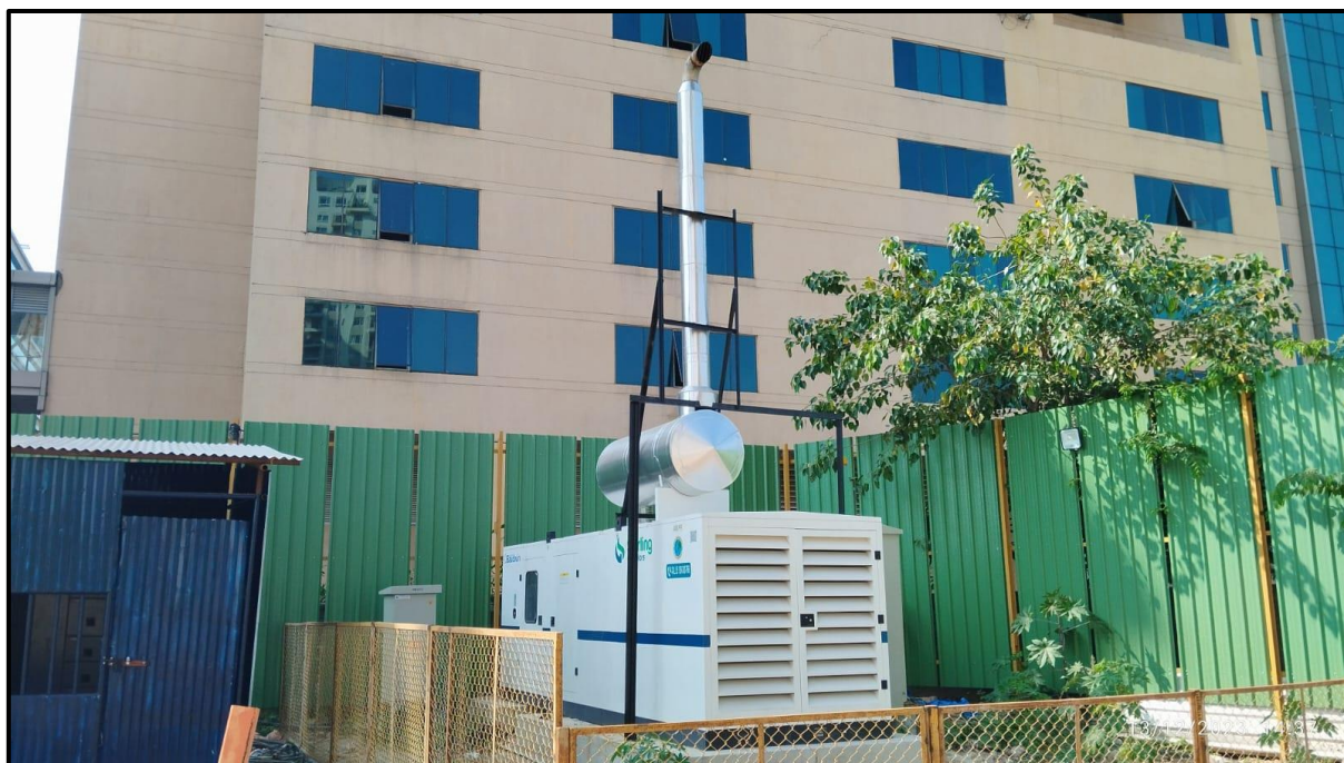
Photograph: Enclosed Type Silent DG Set