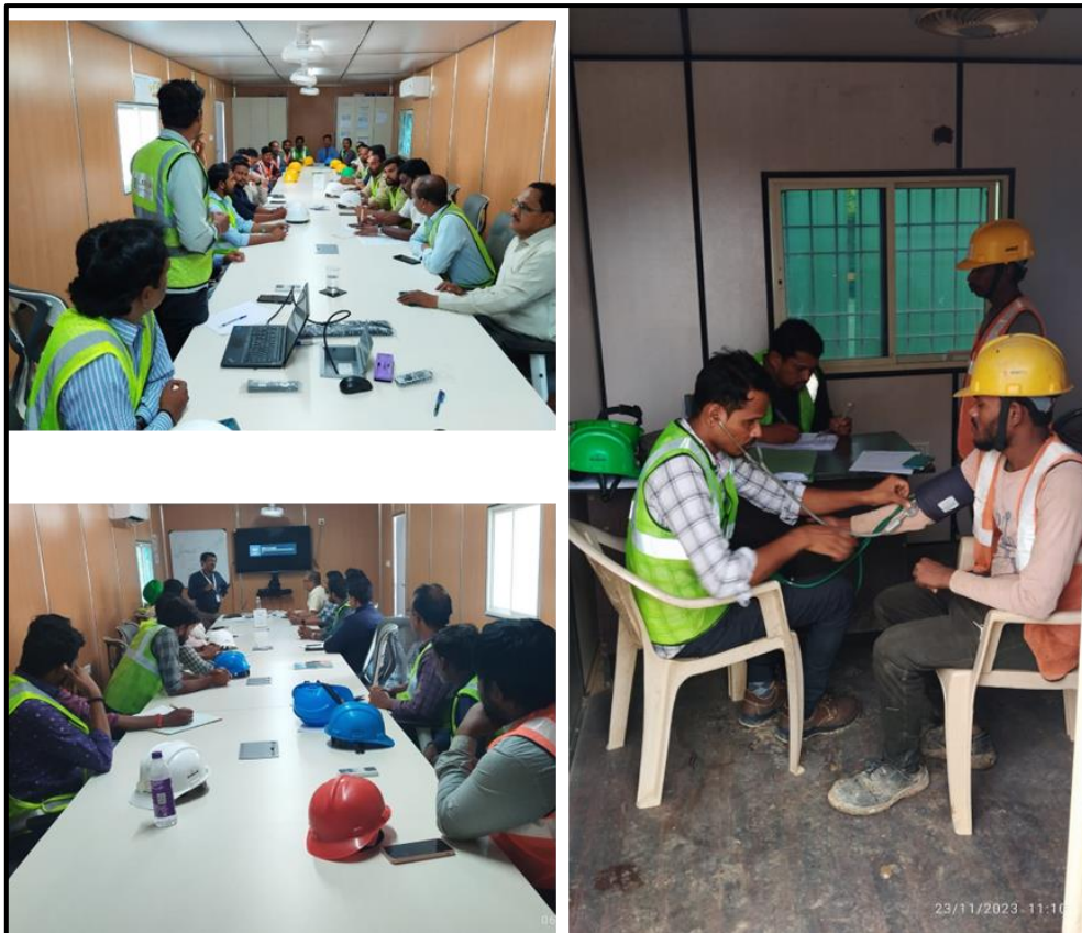
Photographs: Safety Meeting and Medical Examination Camp at Project Site