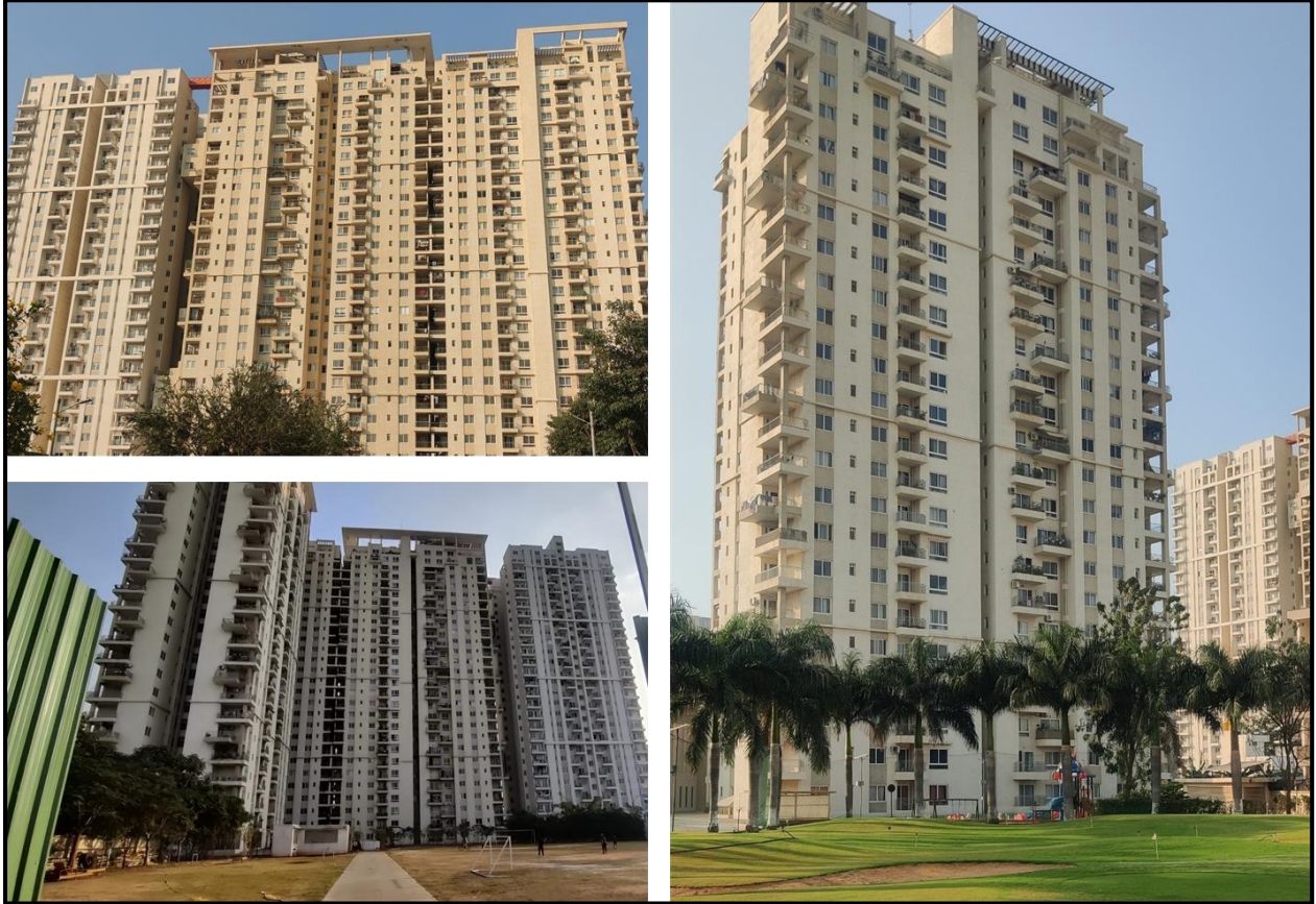
Photos: Completed Blocks of the Project

Few photographs of the completed blocks for which CFO is obtained and are under operation are given below.