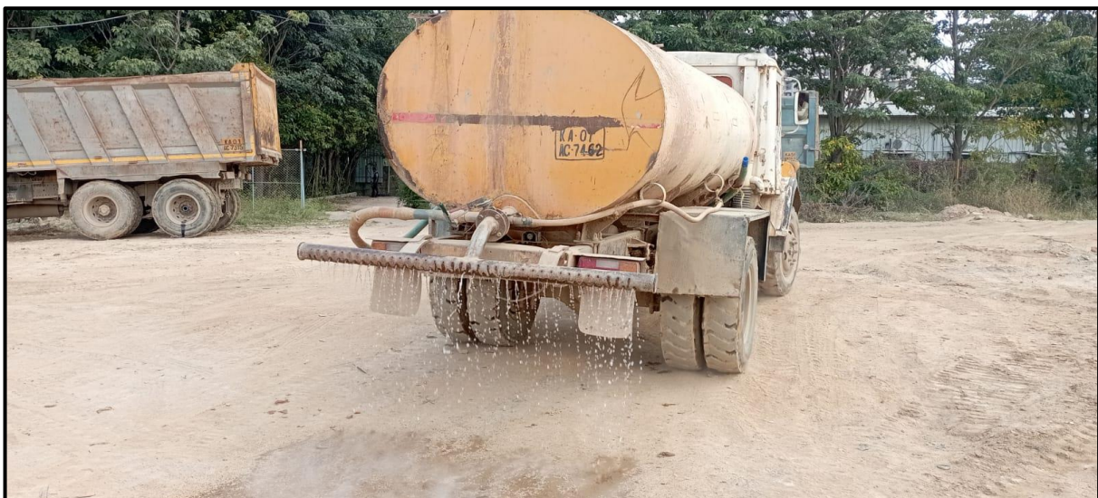
Photographs: Water Sprinkling for Dust Suppression

Condition Complied. Regular water sprinkling is carried out on unpaved surfaces to suppress dust emissions from the movement of construction vehicles within the project site.