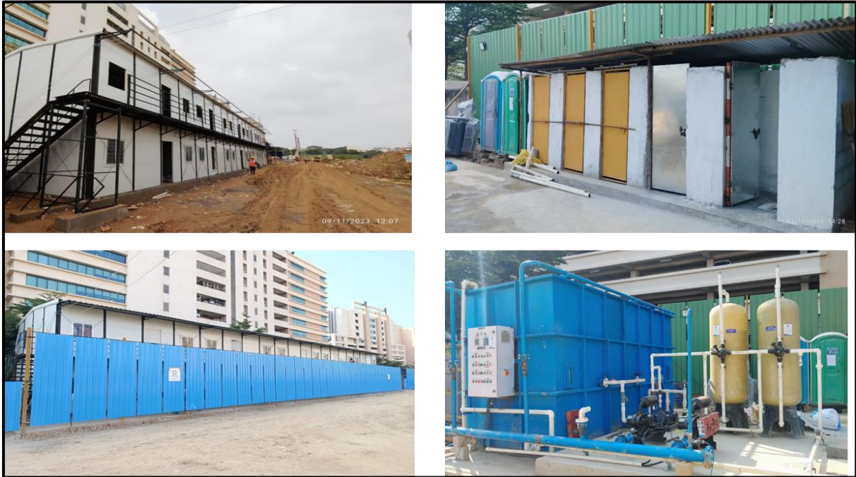
Photographs: Labour Colony at Project Site