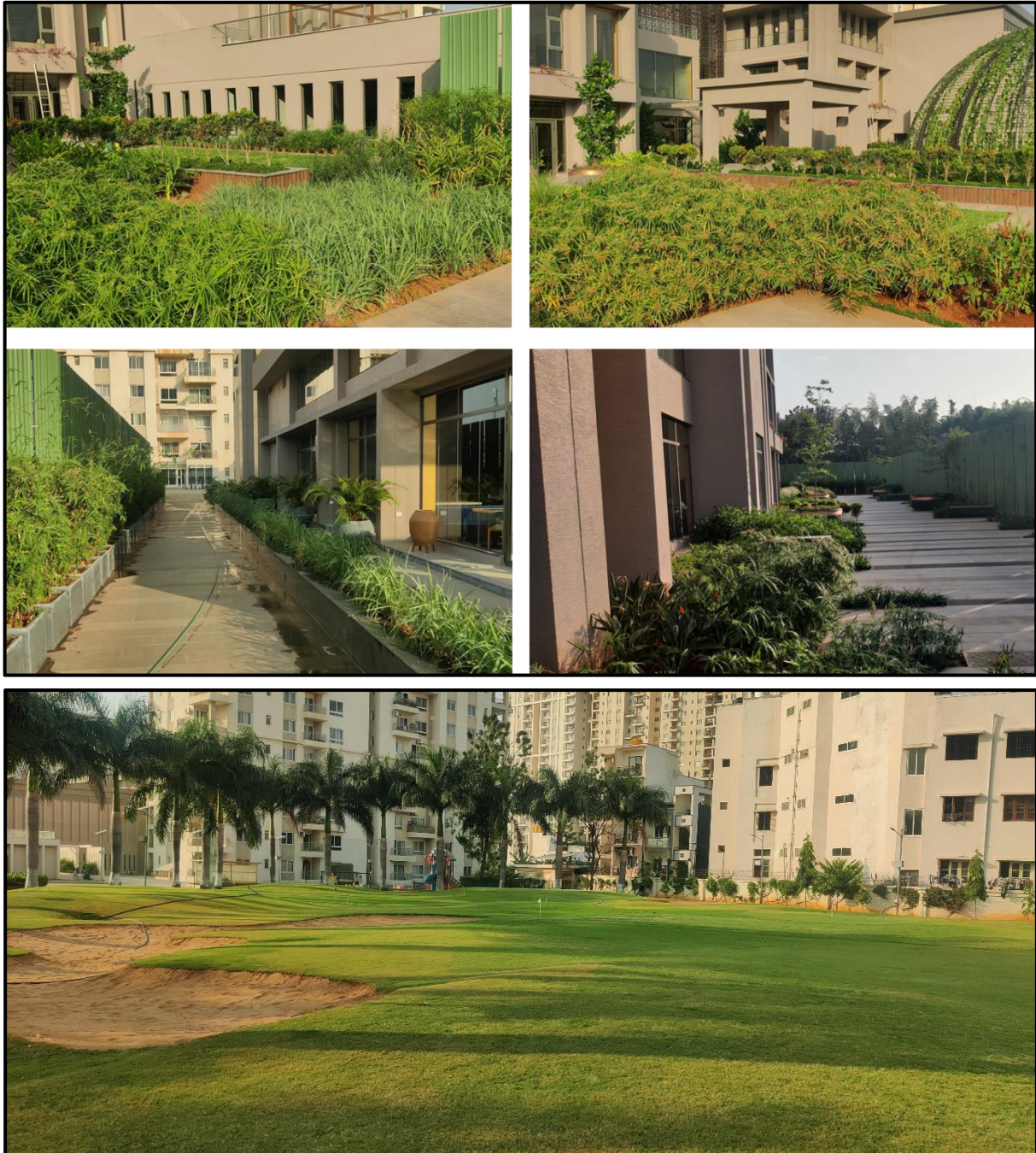
Photographs: Landscape / Greenbelt at Project Site