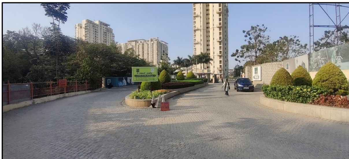
Photographs: Entry / Exit of Project Site