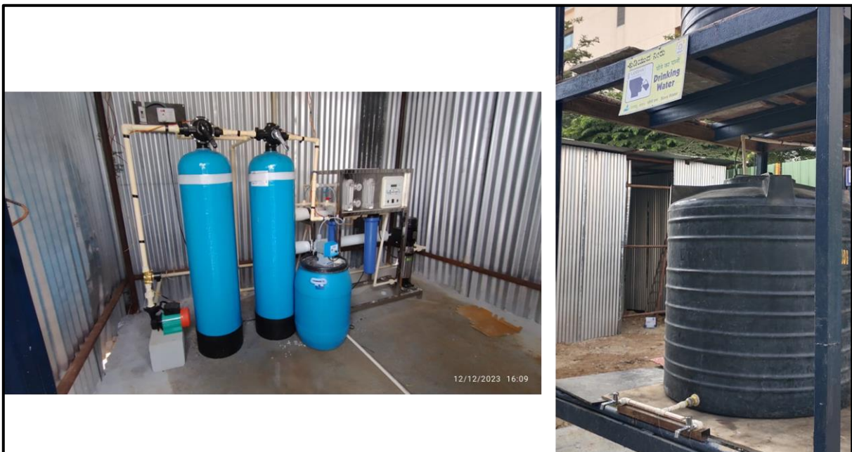
Photographs: Drinking Water Facility at Project Site and Labour Colony