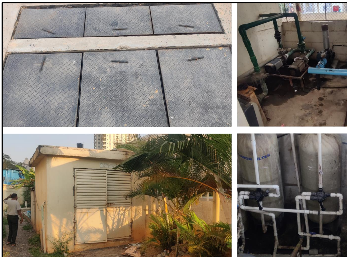
Photographs: STP at Project Site

18. No sewage or untreated effluent water would be discharged through storm water drains.