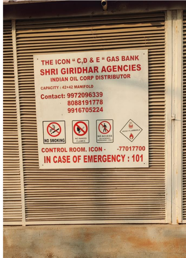
Photographs: LPG Gas Bank for Phase 1 of the Project