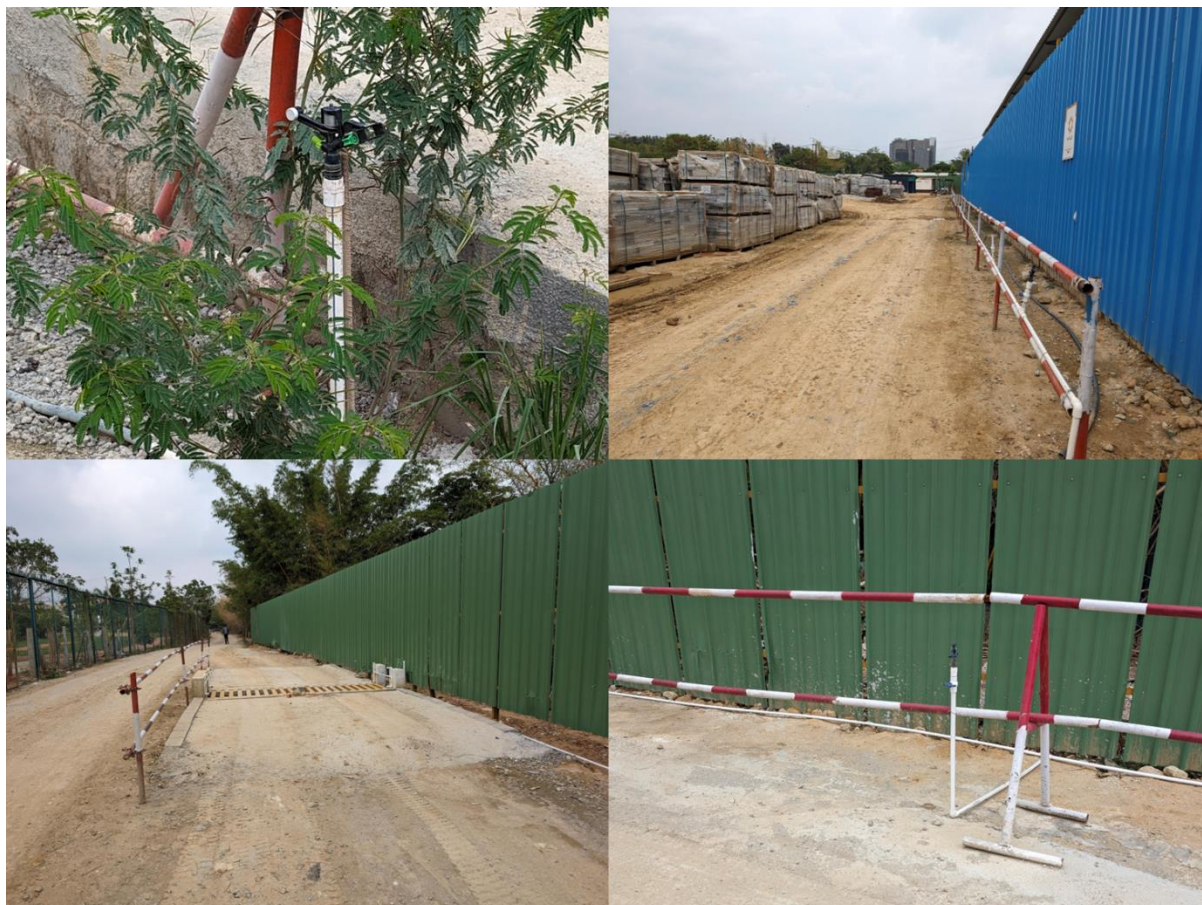
Photographs: a., b., & d. Sprinkling System for Dust Suppression along the temporary Roads within the project site, c. Tyre Washing Bay