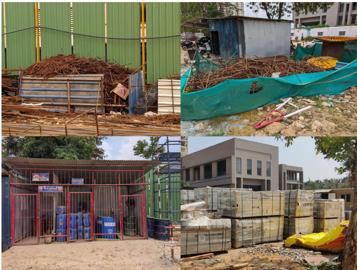
Photographs: a. & b. Construction Waste Segregation and Storage, Waste Barrels and Chemical Cans Storage Area and d. Storage of Aluminum Framework Structure.

10. The diesel generator sets to be used during construction phase shall be low sulphur diesel type and shall conform to standards prescribed under Environmental (Protection) Rules for air and noise emission standards.