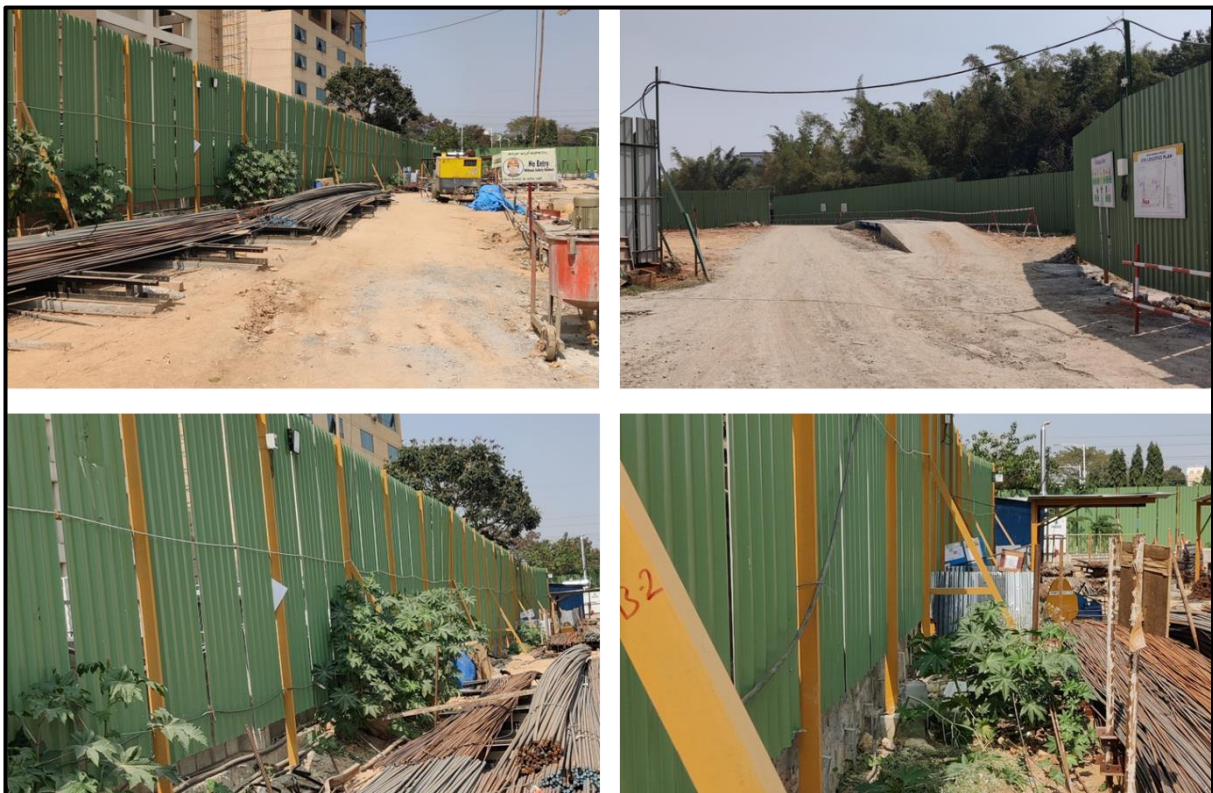
Photographs: Site Barricades all around the Project Site

Condition Complied. Site is barricaded all round the project site.