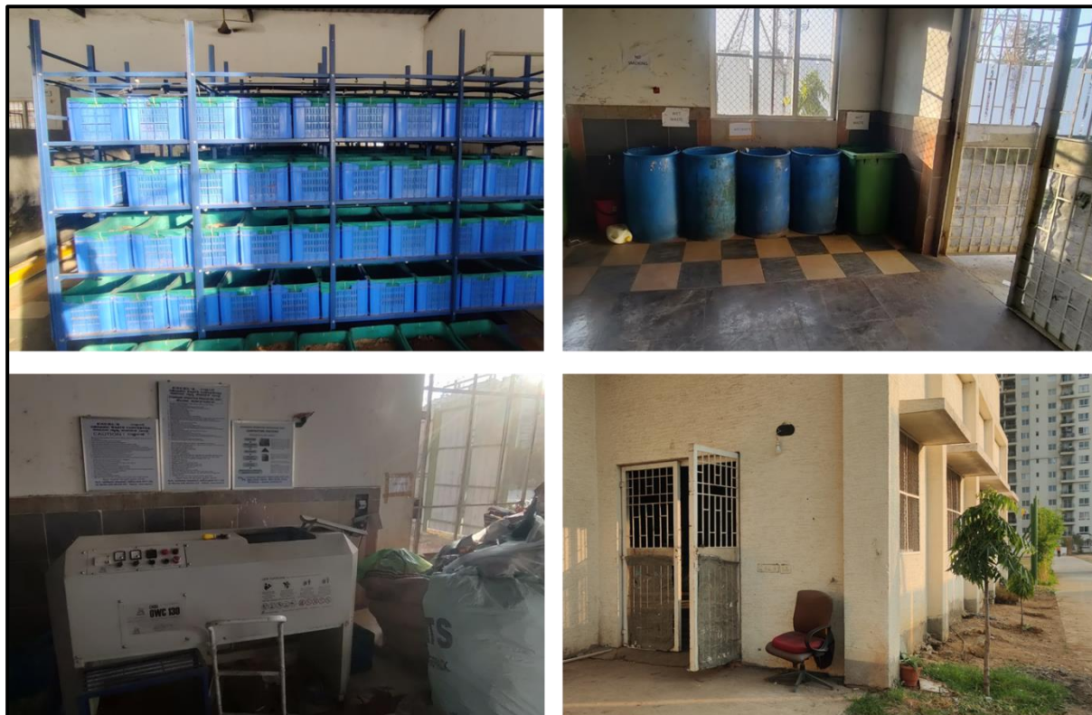
Photographs: Solid Waste Management Facility at Project Site