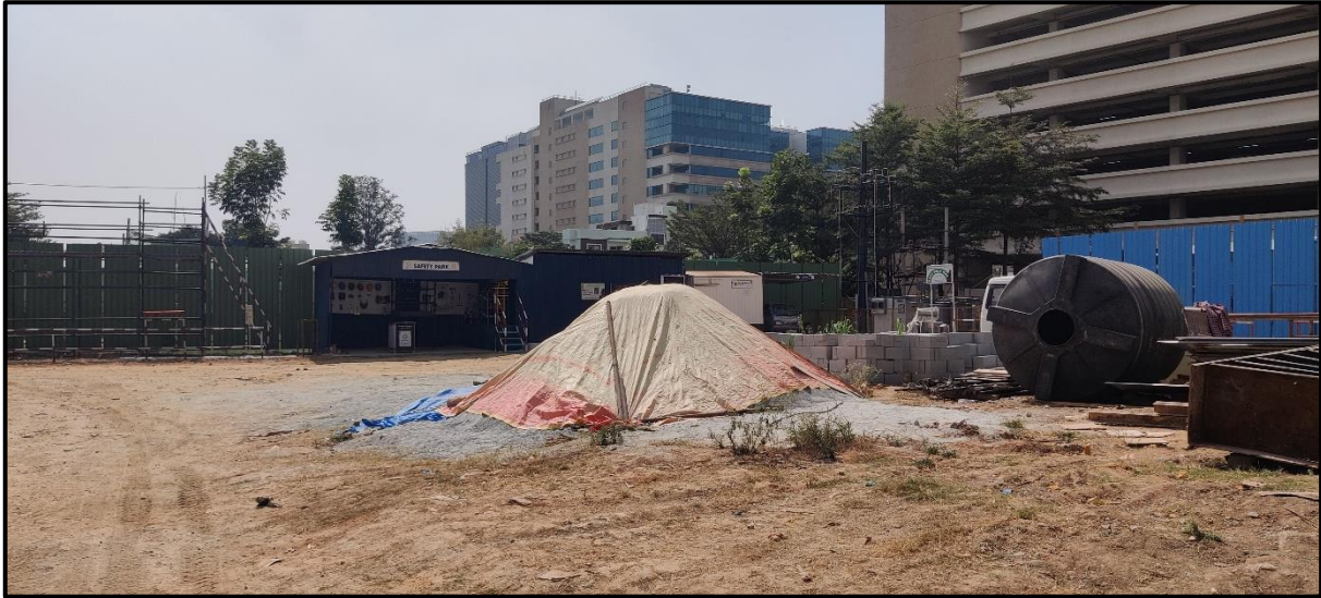
Photographs: Loose Construction Materials is Covered using tarpaulin sheets

Condition Complied. Sand, murrum, loose soil, cement, stored on site are covered using tarpaulin sheets to prevent dust pollution.