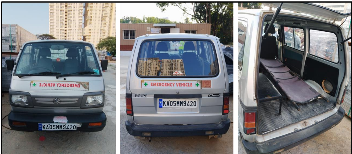
Photographs: Emergency Vehicle at Project Site