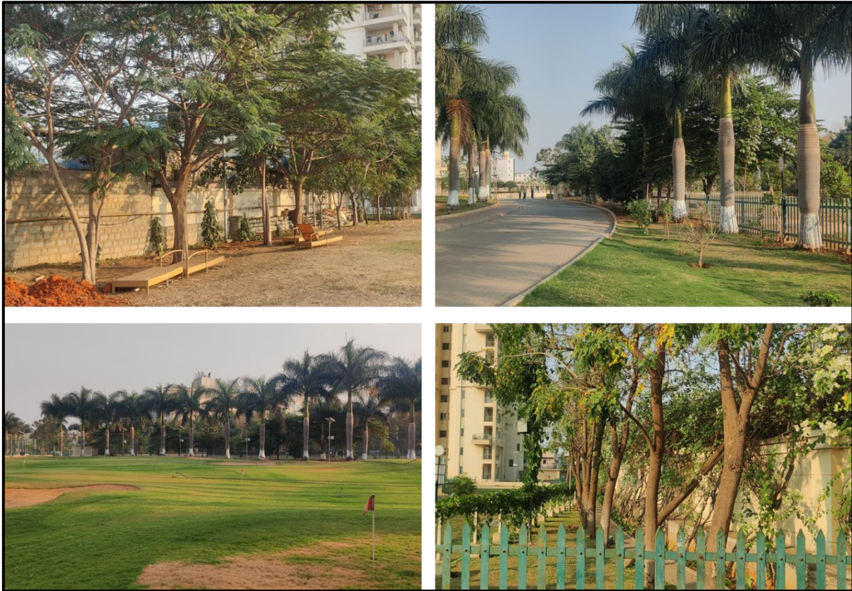
Photographs: Landscape / Greenbelt at Project Site