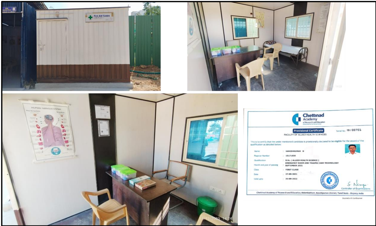
Photographs: First Aid and Medical Room at Project Site