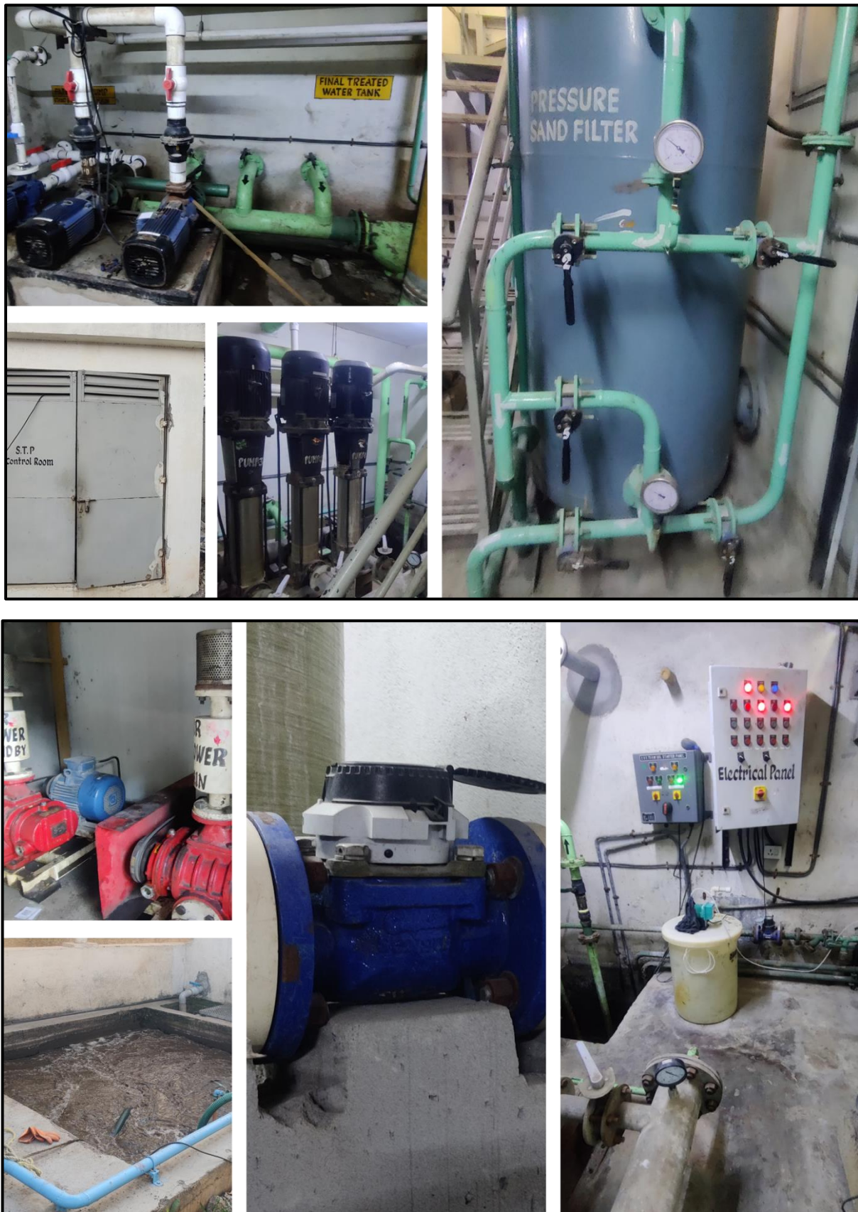
Photographs: STP at Project Site